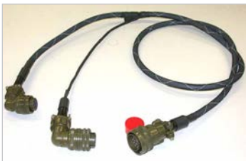
Industrial excavation vehicle