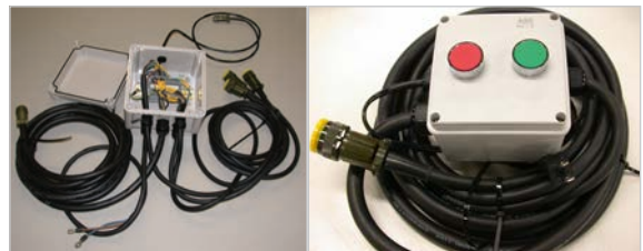
Assorted switchbox applications