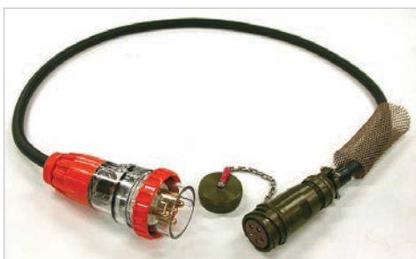
Defence remote 3-phase power generator