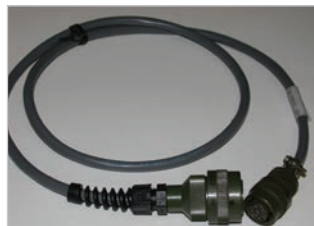
Industrial mining application